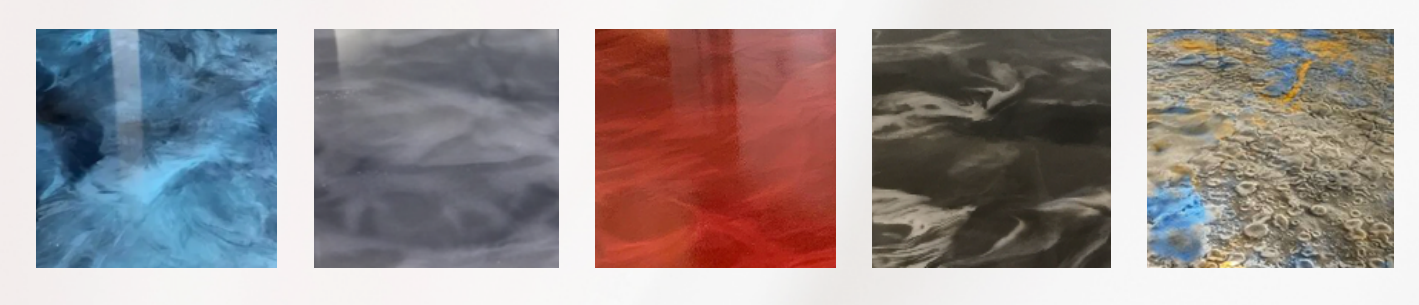
Customizations And Mixtures Of All Colours!